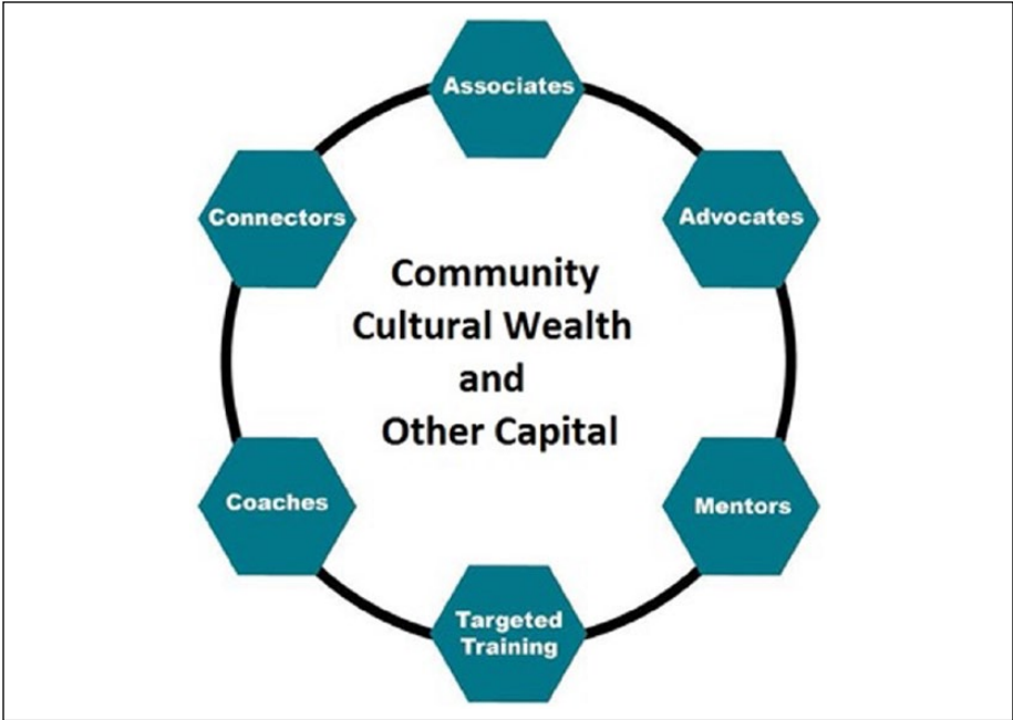
Figure 1. Thrive Mosaic (TM) developmental framework with TM partner roles. Initial TM partners often come from the collection of the scholar's networks.